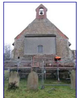
Work Starts on the Roof

While work takes place in the church it will still be open for visits, for prayer and for normal 9.30 am Sunday services. You are welcome to see the work as it progresses — subject to reasonable safeguards, of course!